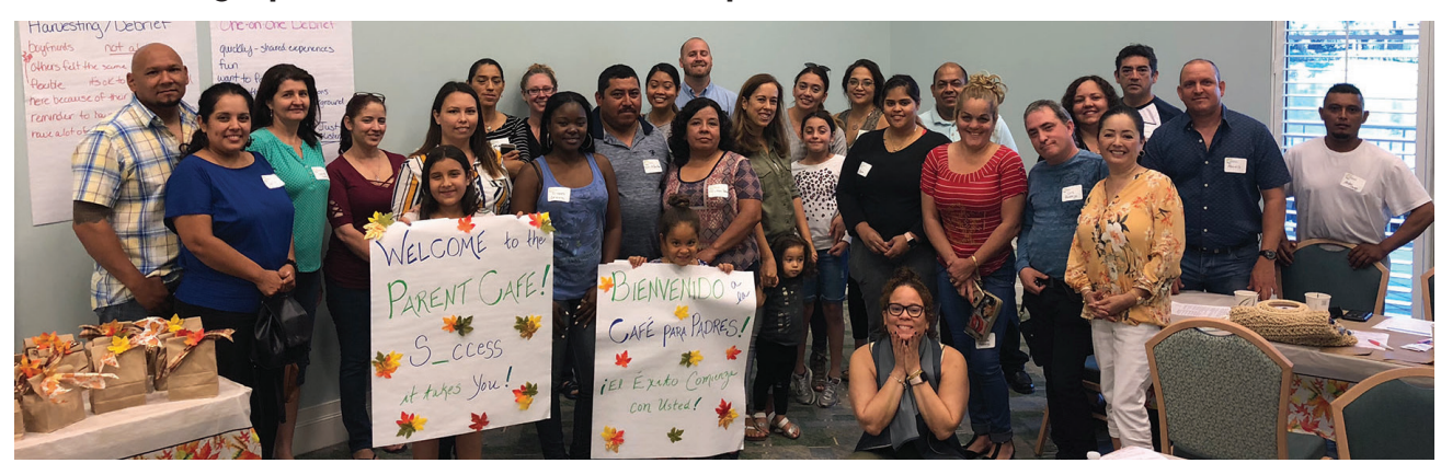
Parent Cafes have already started to take place throughout Collier County and show early success by impacting more than 300 parents.